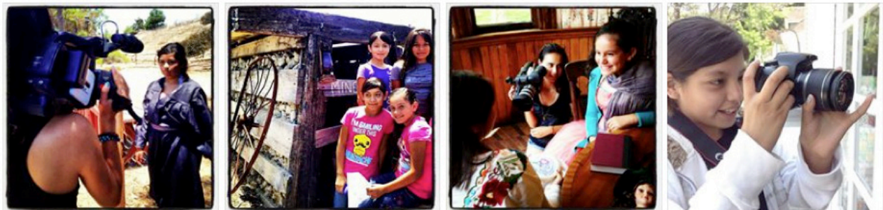
Students from the Youth Cinema Camp at the Heritage Museum of OC.